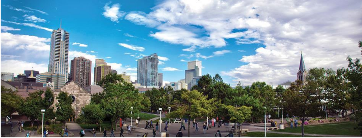
Auraria campus

In Collaboration with Metropolitan State University of Denver (MSU Denver) and the Community College of Denver Confucius Institute (CCDCI)