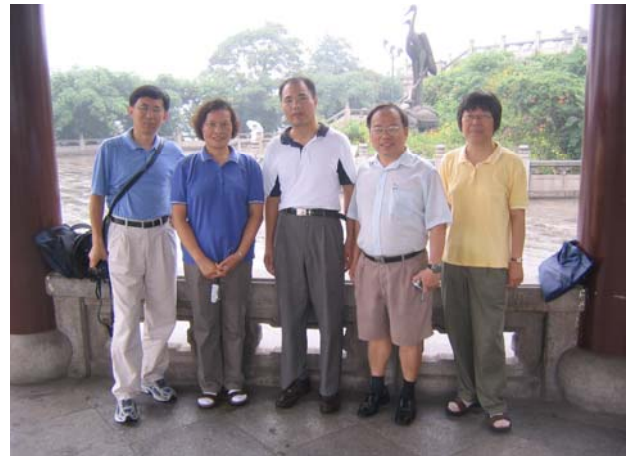
Wuhan lecture tour members