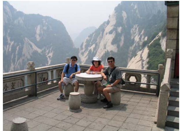
Members on top of Hua Shan