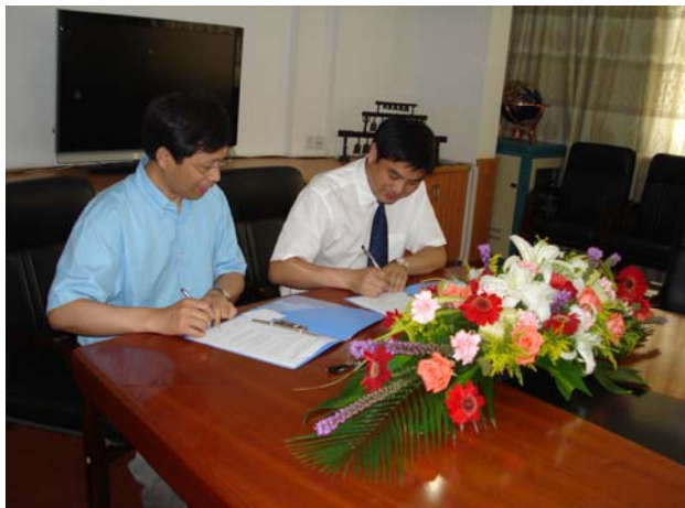
LU signs agreements with Hubei Ke Xie

The Wuhan group also had extensive discussions with leaders and members of Hubei Provincial Association of Science and Technology, acknowledging the success and positive impact that ACPSS lecture group brought upon hosting institutions. A memorandum of establishing long-term working relationship and continuing academic exchange was signed at the end of visit.