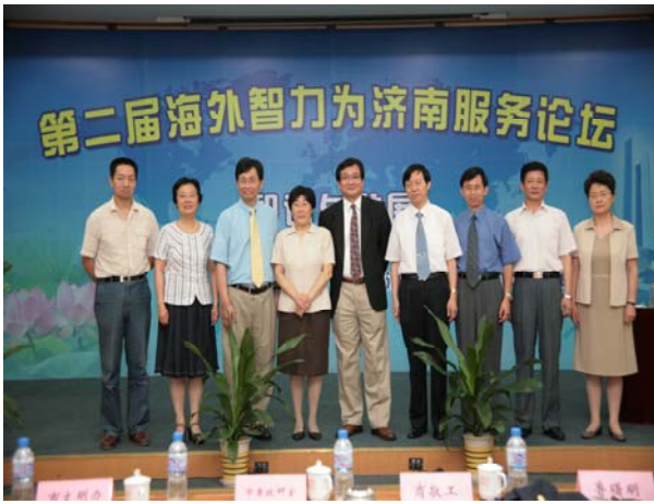
Jinan lecture tour members