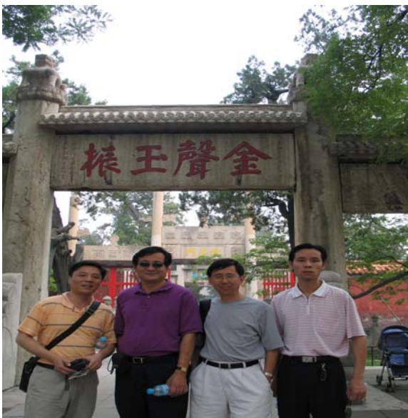
Members in Shangdong