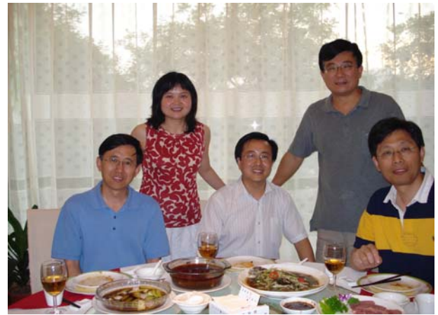
Xi'an lecture group members