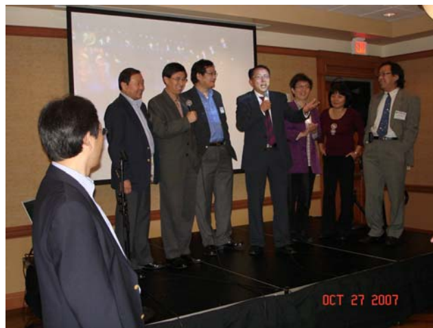
ACPSS board members singing in group at the Ohio Conference evening party