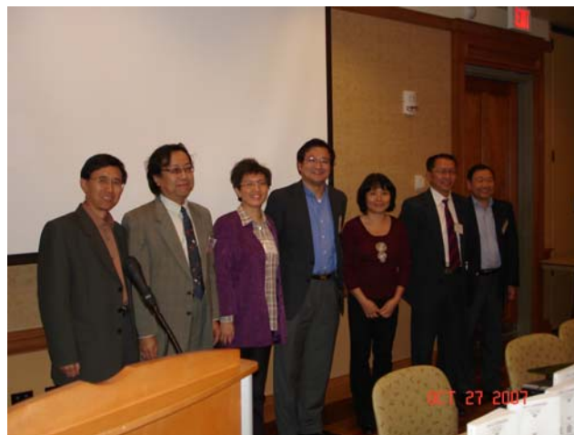
New ACPSS Board of Directors (from the left):