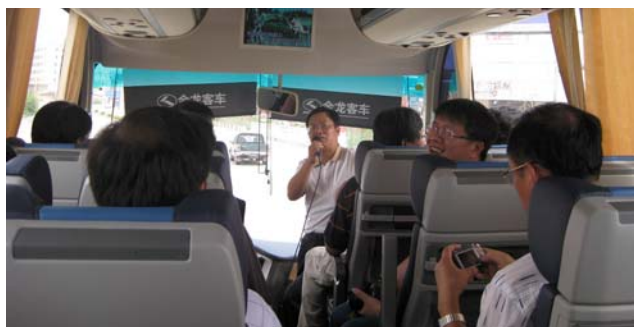
Feature Photo: ACPSS on the move