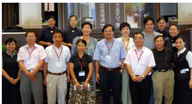
ACPSS delegation in Taiwan, visiting Ciji recycling station in Taipei, Taiwan, Summer, 2007